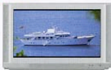
Most HDTVs Wide Screen