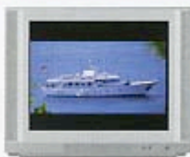
Standard Definition (SD) and some HDTVs Regular Screen